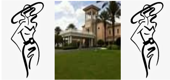
Lakewood Ranch Women's Club (LWRWC) 8374 Market Street, Box 429 Lakewood Ranch, FL 34202